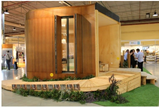
Figure 2: Prototype "Identity Architecture".

In addition, with the aid of this novel method, the construction of a single-family house in Polop de la Marina (Alicante) has been completed with very positive results (see Figure 3 ), while a total of 8 more houses are in the drafting stage.