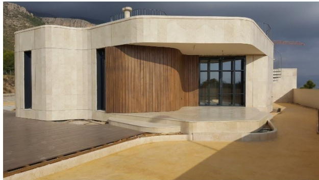
Figure 3: Housing "ADI 90.91.2.8.59.11.40.15".

In addition, with the aid of this novel method, the construction of a single-family house in Polop de la Marina (Alicante) has been completed with very positive results (see Figure 3 ), while a total of 8 more houses are in the drafting stage.