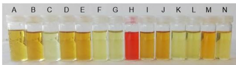
Figure 2: Nitrite ion selective detection test (NaNO 2 , reddish solution), against thirteen anions, using a formylindolizine in acidic medium. Salts: KCN, PhCO 2 K, KF, KCl, KBr, KI, KOAc, K 2 P 4 O 7 , K 3 PO 4 , KH 2 PO 4 , NaN 3 , K 2 S y NaHS. All concentrations are 10 -4 M.

The resulting products have shown high selectivity in the detection of nitrite ions compared to other thirteen anions in an acidic medium. The presence of the nitrite ion with this test is manifested in solution with the appearance of a coloration ranging from reddish, more or less intense, to pinkish, depending on the concentration of the nitrite ion, while the rest of the anions present a pale yellow colour or are colorless (see Figure 2).