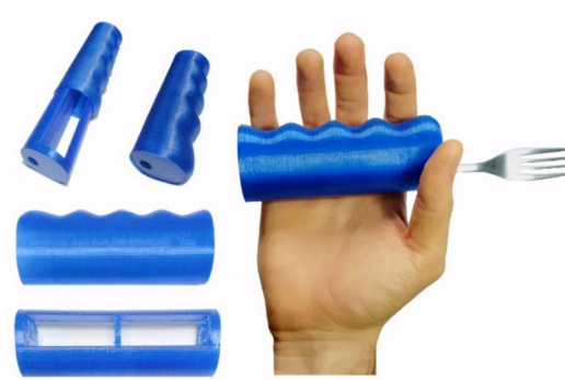
Figure 2: Prototype of the device with eating head