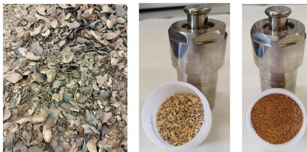
Picture 2: Different biomass residues used in the laboratory tests, including cocoa shells, eucalyptus wood and almond shells, respectively.

The catalysts obtained have been characterised using various techniques to determine their structure and composition, among them: