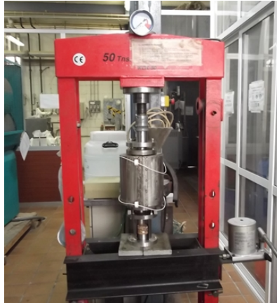
Figure 3.- Hydraulic piston press briquette machine used

For these tests, a hydraulic piston press briquette machine has been used (Figure 3) to obtain briquettes with 53 mm diameter and a variable height between 20 and 60 cm, although the process is applicable to any size and briquette shape (brick, cylindrical, tablet-shaped, square or similar).