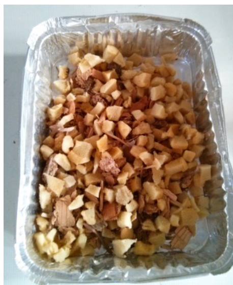
Figure 1.- Initial mixture of furniture waste with polyurethane foam

The compacted material developed is formed mainly by biomass and foam (Figure 1). Whereas biomass (lignocellulosic) consists of waste wood or timber products, the foam is composed of polyurethane foam or similar from sofas, cushions, pillows, chairs, mattresses, etc.