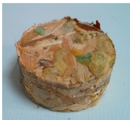
Figure 2.- Briquette obtained with a mixture of furniture waste and polyurethane foam

As a result of this research, we have obtained briquettes with physicochemical characteristics similar to conventional briquettes (made of wood) in terms of resistance to fragmentation and abrasion, durability (DU - according to European standard CEN-TS 14588: 2003), density and calorific value, appropriate for use as industrial fuel (Figure 2).