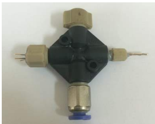
Figure 3. Photograph of the laboratory-constructed prototype

Experiments and tests have been performed to confirm its reliability, reproducibility, robustness and that it is easy to handle.