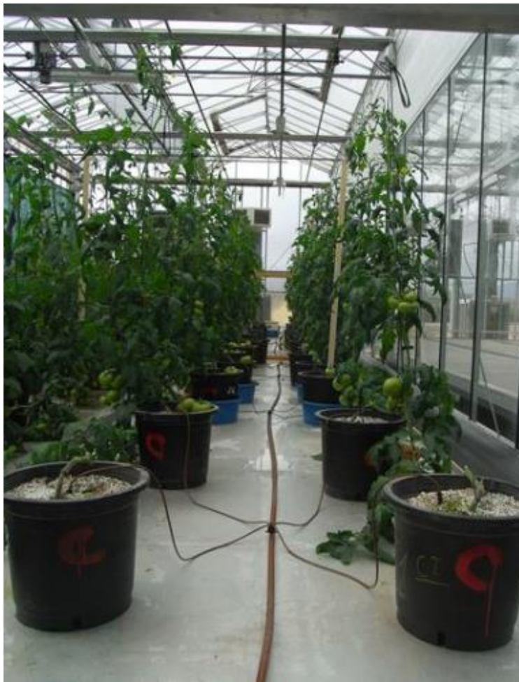
Greenhouse at the University of Alicante