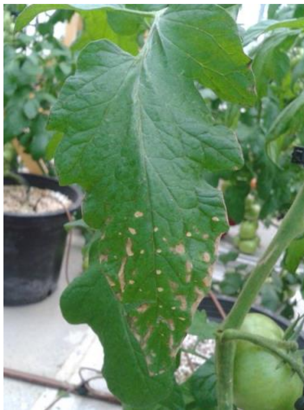
Activation System Acquired Resistance in tomato plants by bacteriosis.

3) Improving the effectiveness of chelates of micronutrients, particularly iron: iron chlorosis traditionally has been the main nutritional disorder in crops grown in calcareous soils, although we must also consider the effects of the lack of other micronutrients as zinc and manganese. These deficiencies are particularly important in fruit and vegetables, causing losses in plant growth, harvest and quality loss in crops. In these cases, the micronutrient application to the soil or foliarly becomes practically mandatory. For iron, synthetic chelates, especially FeEDDHA have been the most effective solution, however low biodegradability in soil has sparked interest in finding solutions equally effective, but sustainable. In recent years, research on correcting micronutrient deficiencies have focused on three ways mainly: