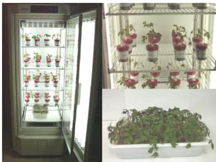
Plant growth chambers at the University of Alicante