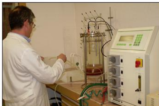
Growing and harvesting operations