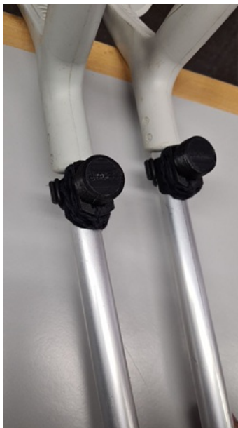
Figure 2: Prototype device

A prototype has been developed based on the participation of different people with functional diversity with whom the dimensions and performance of the device have been tested and adjusted ( see Figure 2 ). It is therefore a device that perfectly meets the intended objectives.