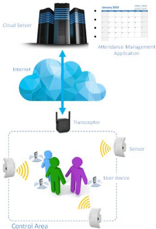
Fig 1. General diagram of the system

presence control applications. The business layers, the persistence layer, and the administration and control layer are located on this server, as well as all associated services.