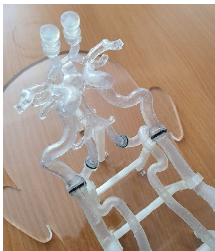
Figure 2: Detail view of the arterial network of the prototype

A prototype has been developed with the participation of different medical specialists who have tested and adjusted the dimensions and performance of the simulator ( see Figure 2 ). Therefore, a device that perfectly meets the objectives sought has been achieved.