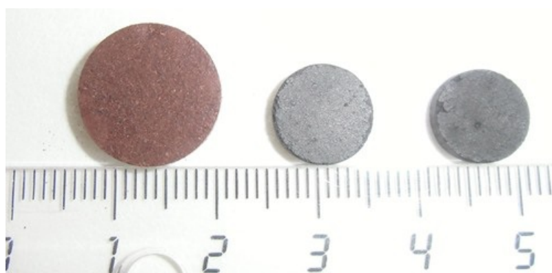
Figure 1: Activated carbon monolith obtained from cocoa shell during the three different steps (from left to right): mounding, carbonized and activated

Through this procedure, it is possible to obtain activated carbon monoliths with a well-defined geometrical shape and good mechanical strength (see Figure 1).