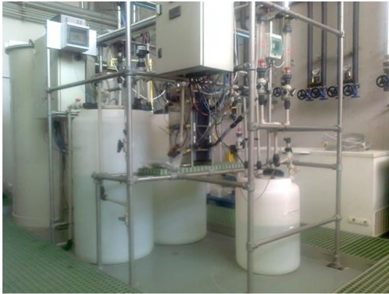
Figure 2. Demonstration Pilot Plant